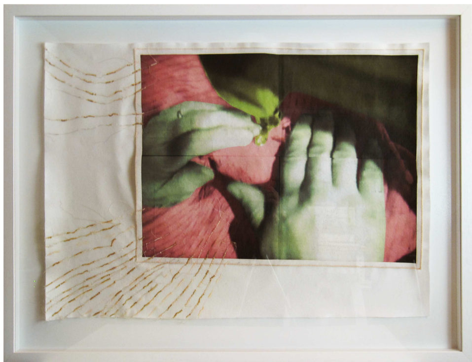
WHAT HER SEWING DID TO ME 0.70 x 1.00 m prints and embroidery on felt